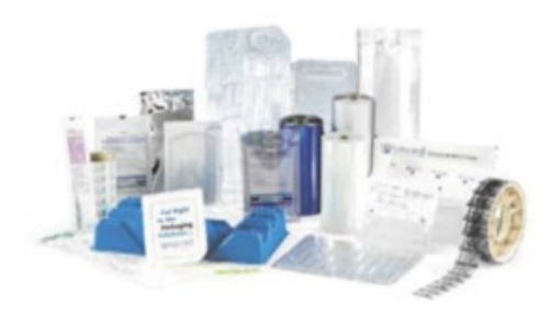
Other Flexibles (Non-Woven and Film Plastics)